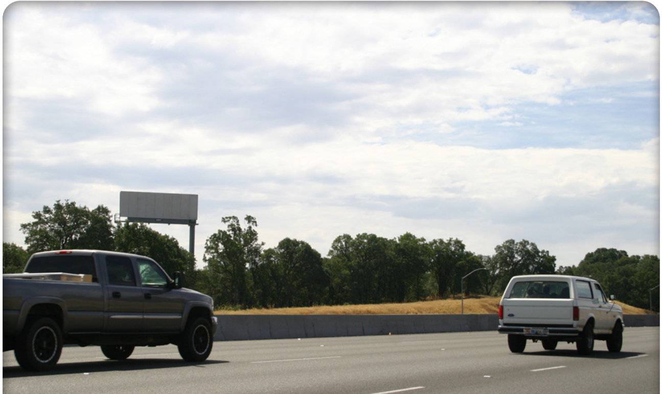
East side of I-5, 0.85mi south of Deschutes Rd Overcrossing