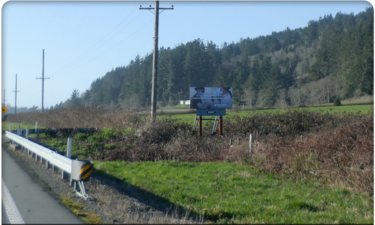
East side of Hwy 101, 6000' south of Salmon Harbor Rd