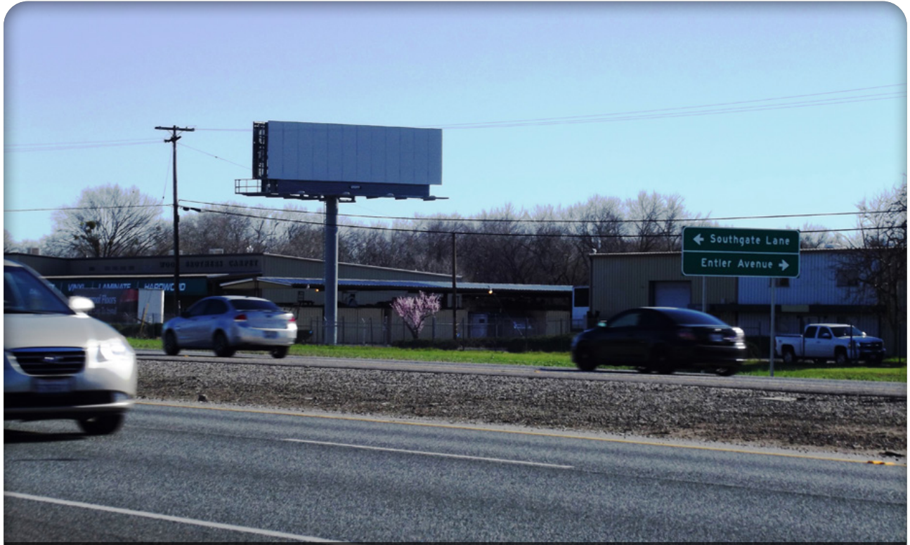
West side of Hwy 99, 400' north of Southgate Ln