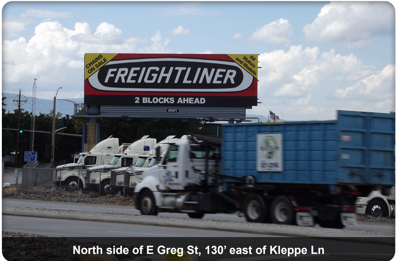
North side of E Greg St, 130' east of Kleppe Ln