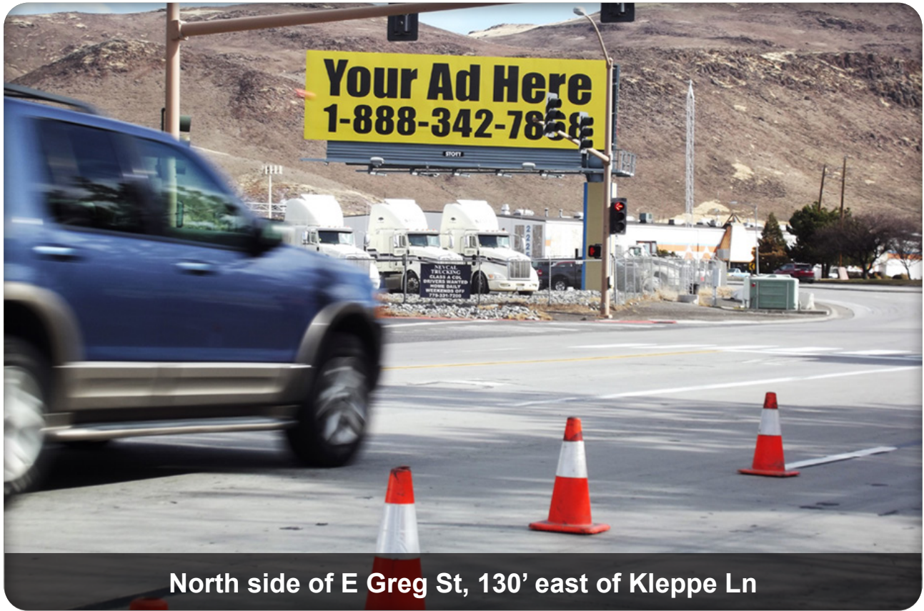
North side of E Greg St, 130' east of Kleppe Ln