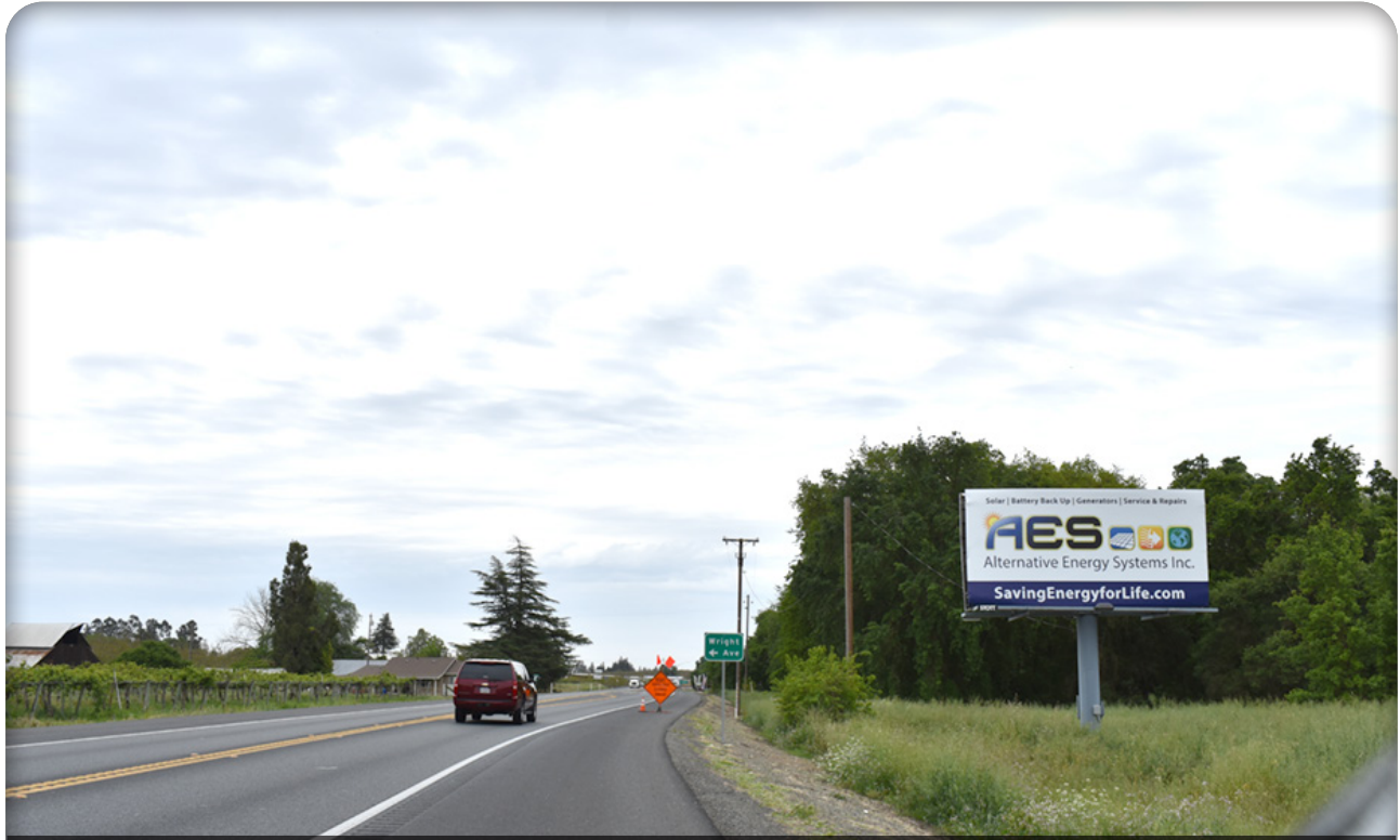
West side of Hwy 99, 1825' north of Evans Reimer Rd