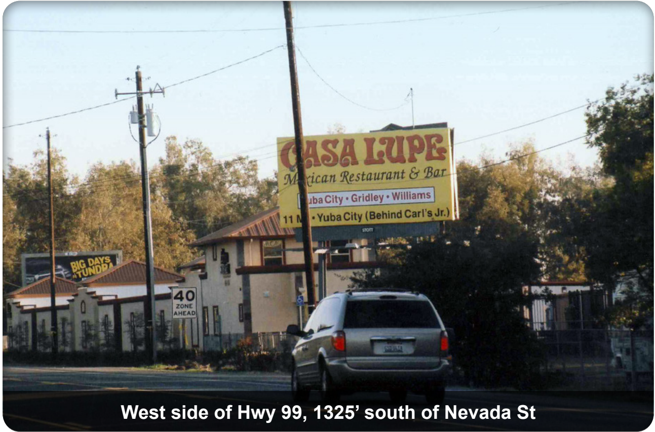
West side of Hwy 99, 1325' south of Nevada St