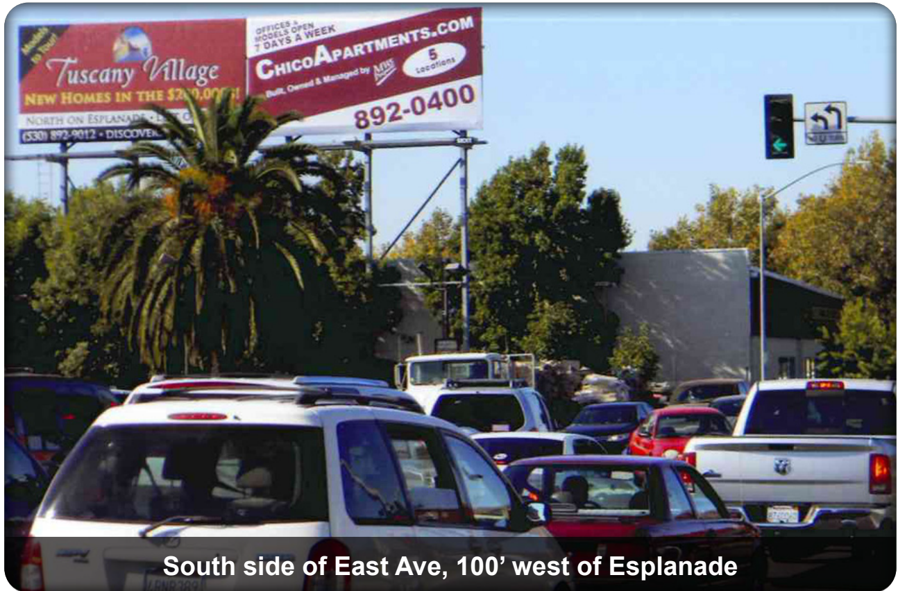
South side of East Ave, 100' west of Esplanade