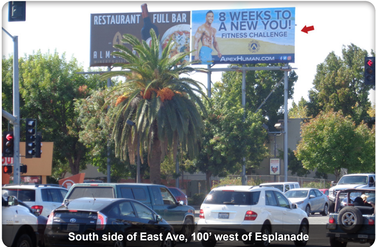
South side of East Ave, 100' west of Esplanade