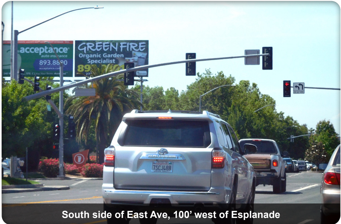
South side of East Ave, 100' west of Esplanade