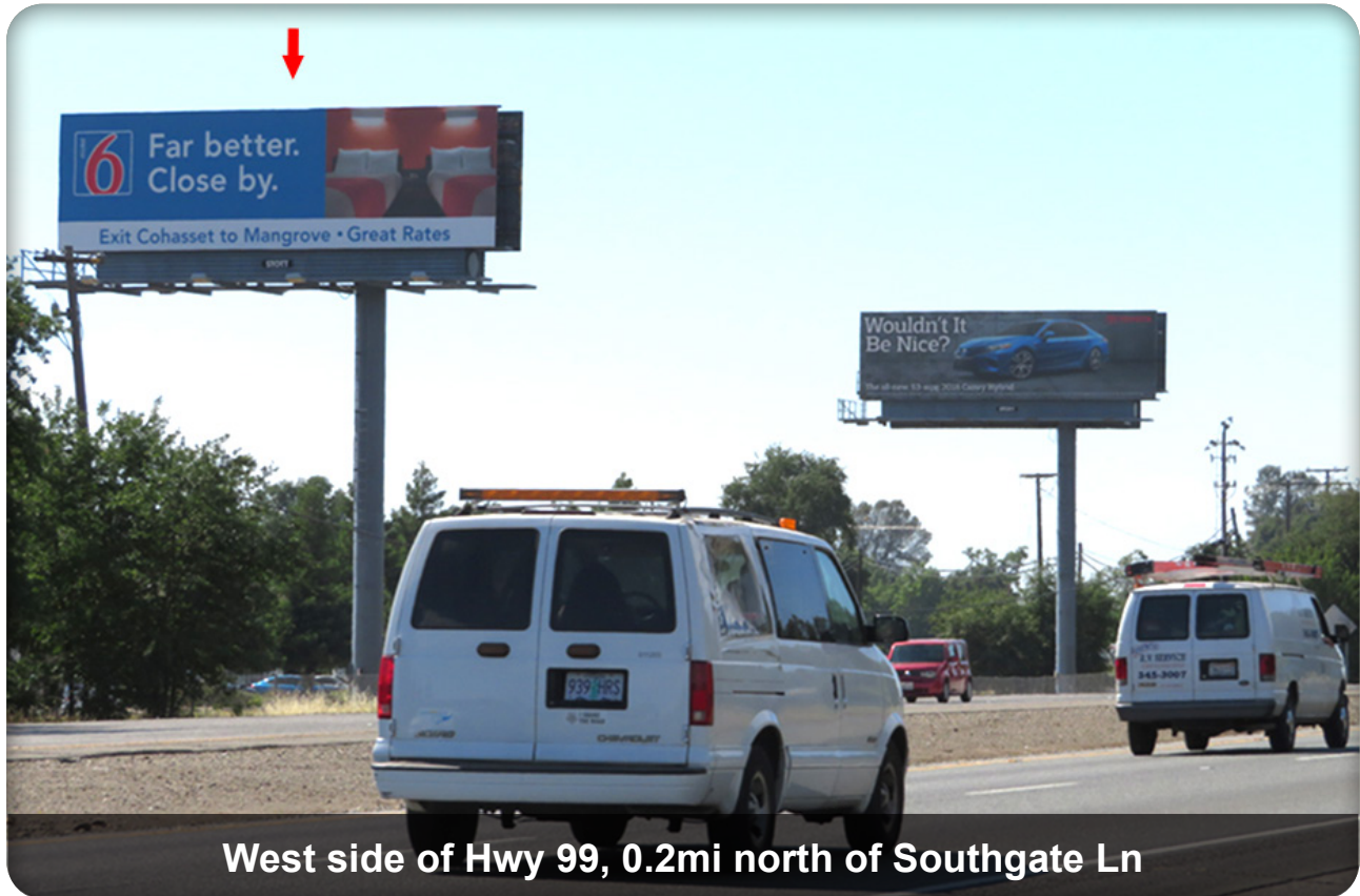
West side of Hwy 99, 0.2mi north of Southgate Ln