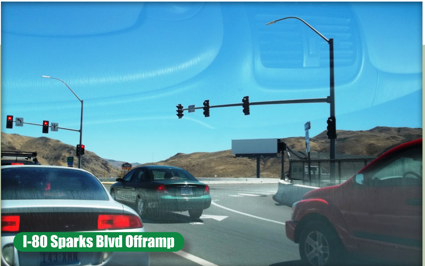
I-80 Sparks Blvd Offramp