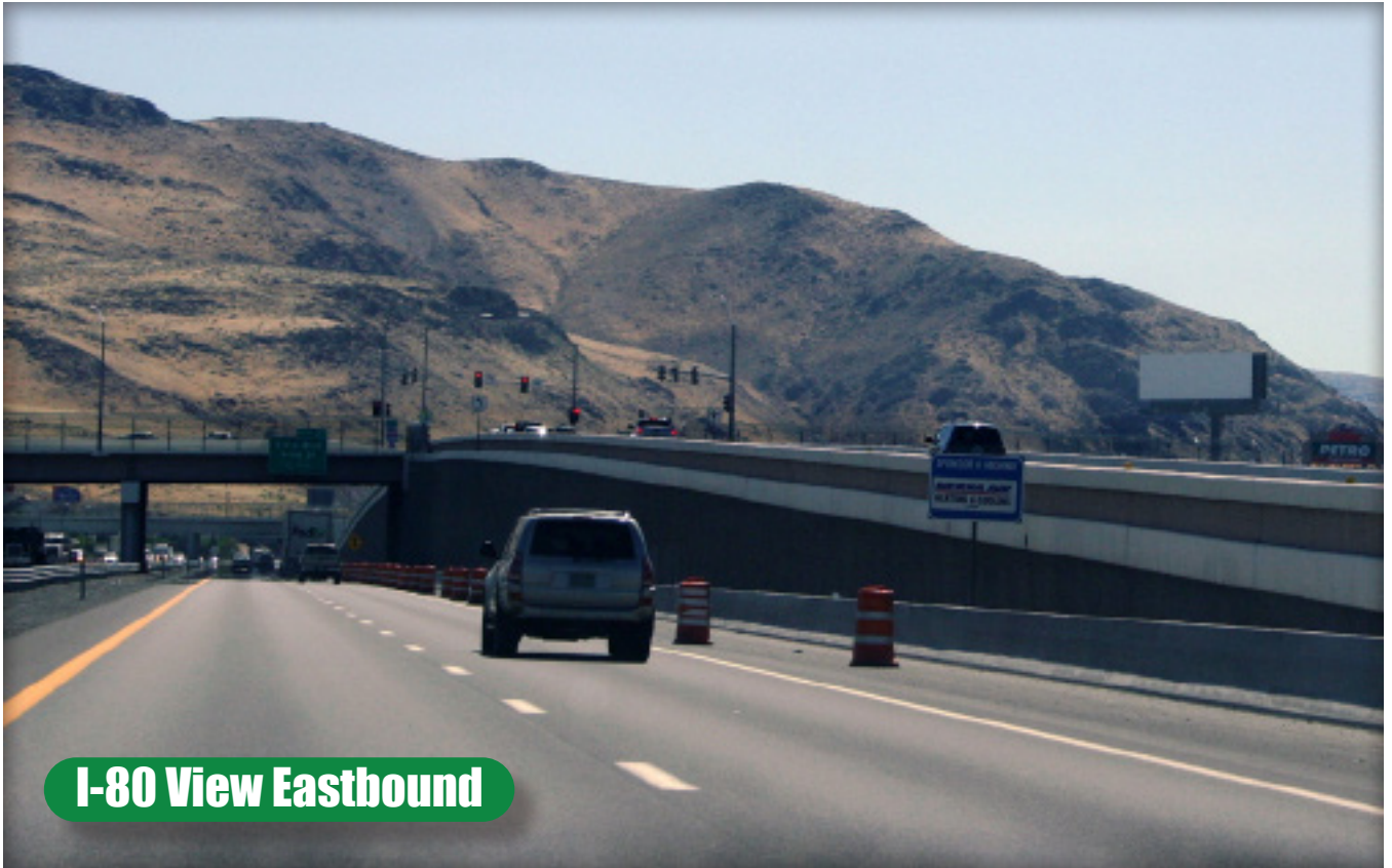
I-80 View Eastbound